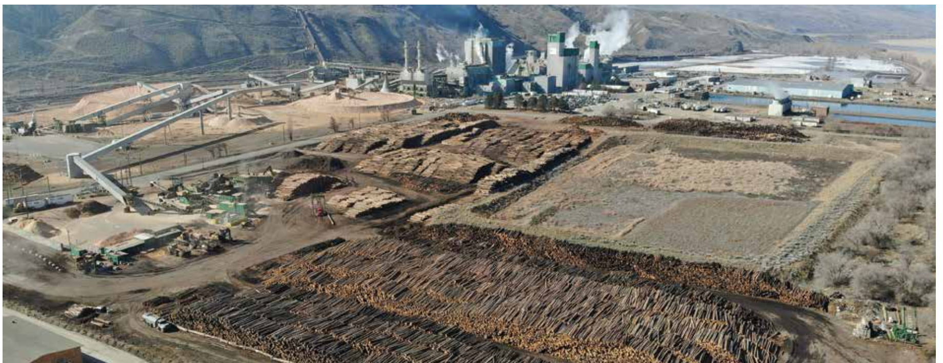
Aerial view of River City LP with Kruger pulp mill in the background