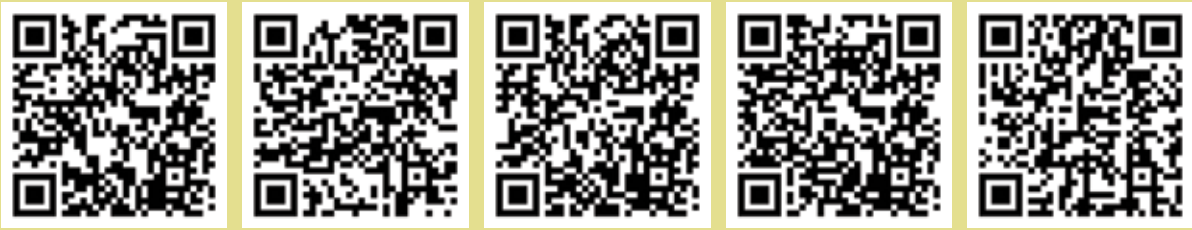
Stretches for Drivers Driver Body Mechanics & Seat Tarping Trailers Handling Tire Chains Arrow Truck Driver and Equipment Operator Warm Up

Shortly we will be releasing resources for other employees including, but not limited to administrators, mechanics, transload operators, marine mechanics and more! Posters with QR codes specific to each location will be displayed in your divisions/offices as well.